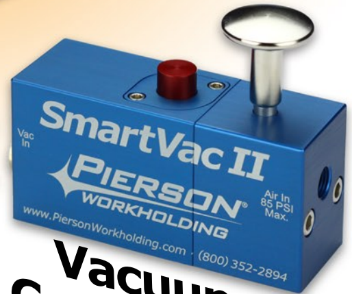
Vacuum Control Unit