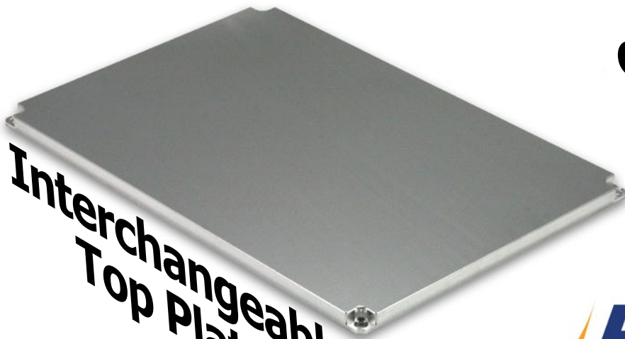
Interchangeable Top Plates