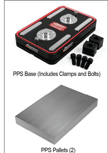
PPS Base (Includes Clamps and Bolts)